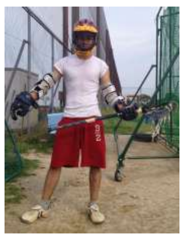
Ready to take on the world.

Soon after that I started my university life. I can't begin to explain how exciting and amazing it was. There were so many events