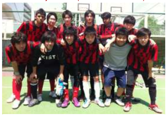
U18 boys futsal