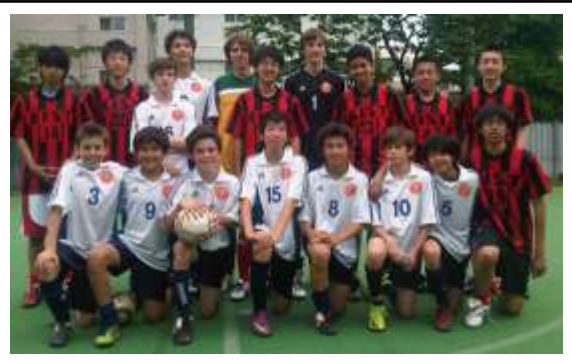
U14 boys futsal (with the BST team)