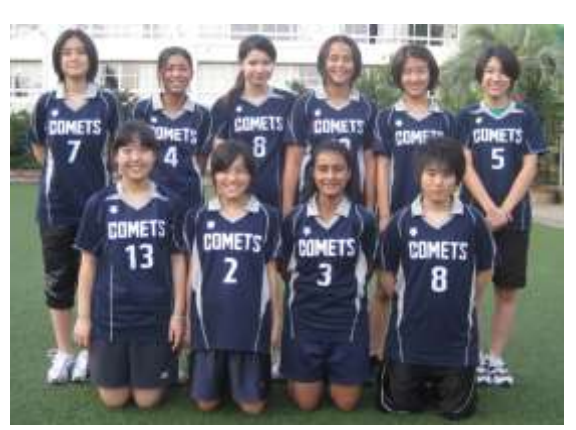
U18 girls volleyball

Athletics Director / Elementary School PE Teacher