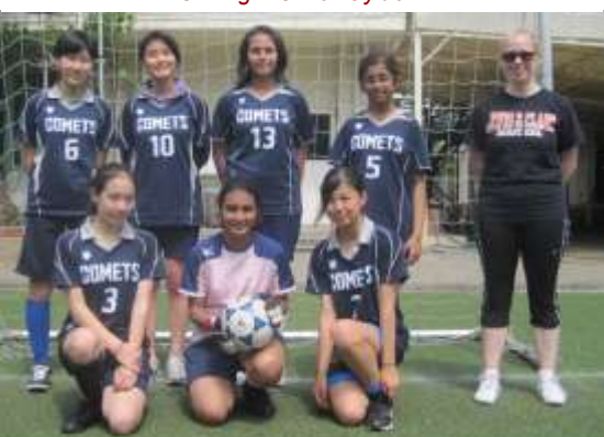
U18 girls futsal